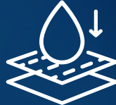
Reverse Osmosis Membrane

Reduces chlorine, chemicals, and pesticides