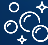
BIO-SURE PLUS™ Filter

Reduces such contaminants as solids, arsenic, pharmaceuticals, and metals