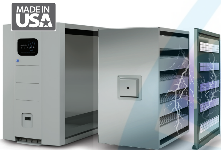
Filter Housing Unit